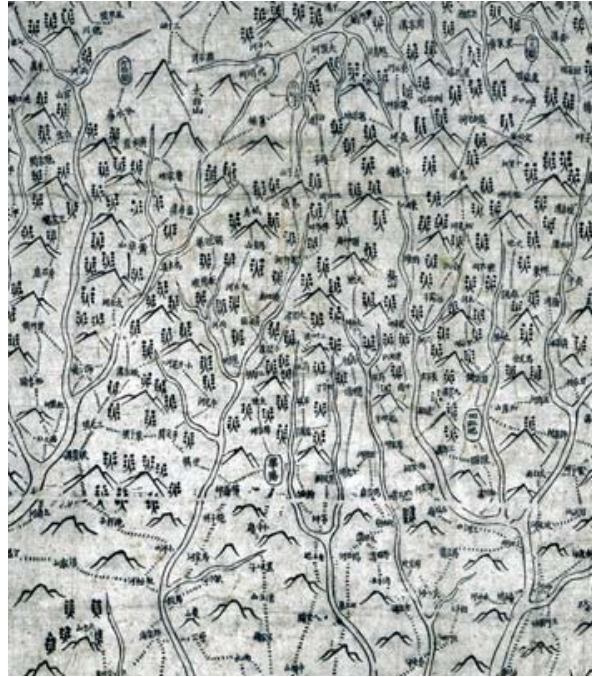
The Central Qinling in Yan Ruyi's "Map of Four Provinces North of the Han River"

This document has been written to provide background information and web references for a set of Google Earth presentations. The subject involves some maps produced between 1813 and 1822 of areas basically in and near the catchment of the upper Han River. They were produced under the overall guidance of a Qing Period scholar official called Yan Ruyi who was Prefect of Hanzhong over much of this period. The Google Earth presentations are collected together into a zip file. Using a zip file forces them to be downloaded onto your computer for display and acts as a protected folder as well. When you unpack the file it will have 6 items on it. One is a PDF of this document and the other 5 are KMZ files providing access to maps and materials that appear scaled to fit at roughly the areas of China they concern. The KMZ files are quite small as the data are accessed via Network Link.