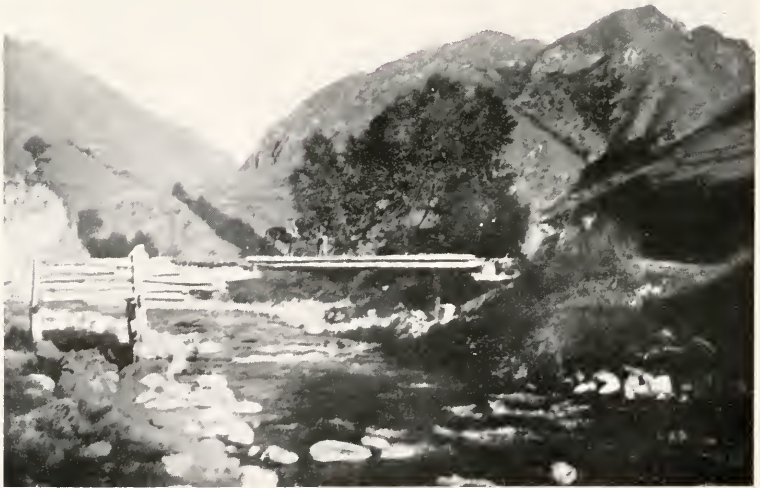
CANTILEVER BRIDGE ON THE ROAD TO LABRANG