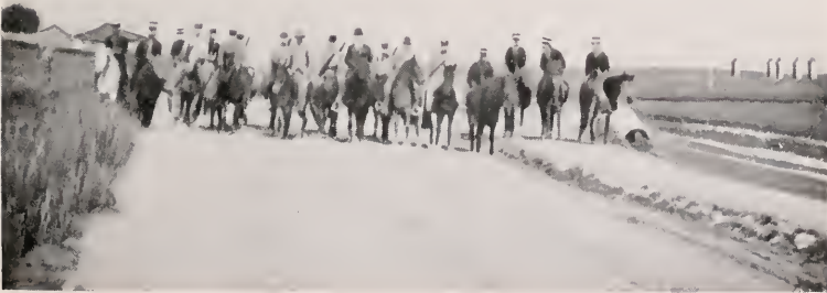
ARRIVAL AT HSIAN FU