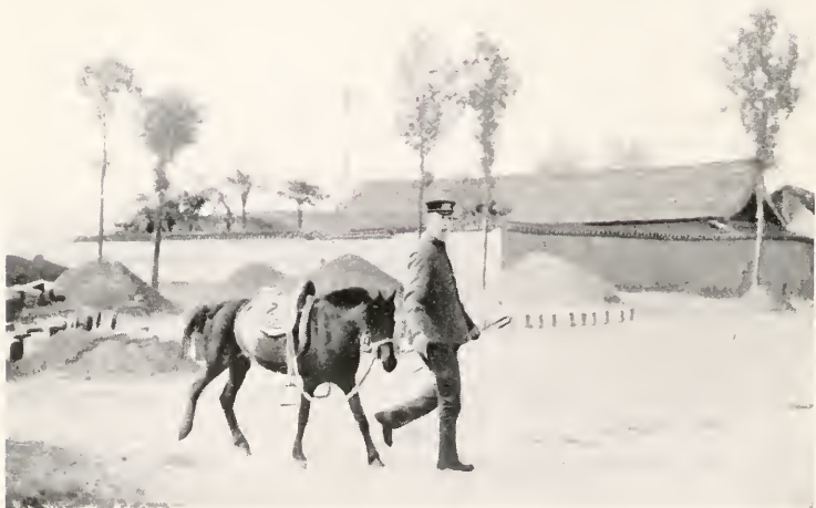
THE DIMINUTIVE SZECHUAN PONY