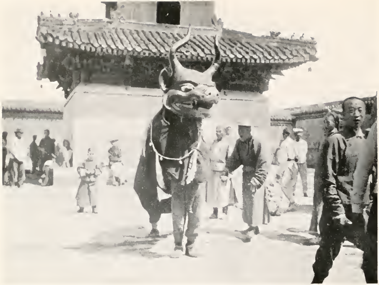
BEHIND THE SCENES AT A LAMA DEVIL DANCE, EASTERN INNER MONGOLIA