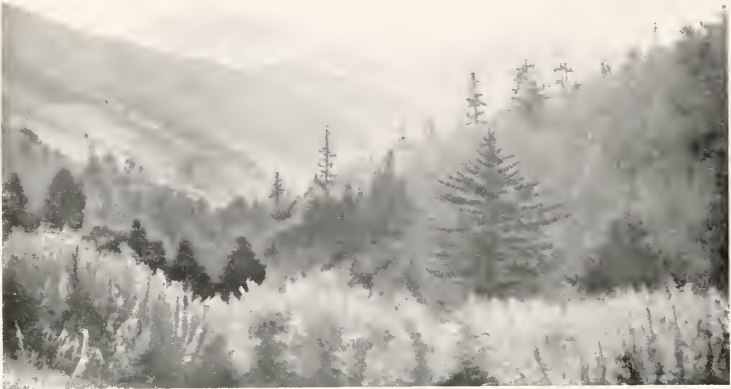
VIEW FROM THE HSINGLUNG LING ON THE FOP'ING TRAIL