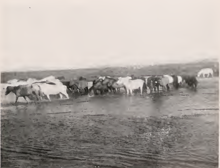
THE "CHINA PONY" ON HIS NATIVE STEPPES