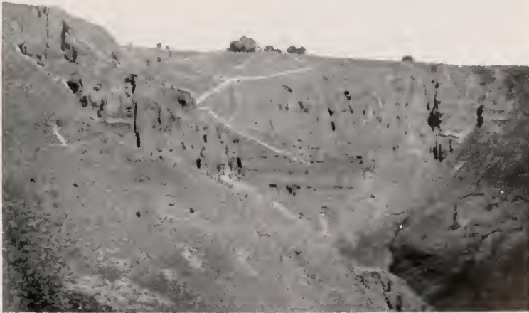
VIEW ACROSS RIFTS IN THE LOESS PLATEAU NEAR FUCHOU