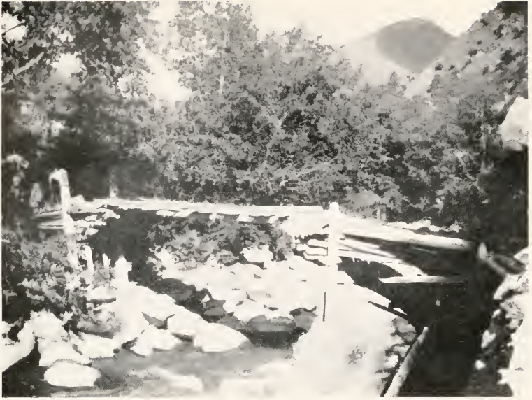
CANTILEVER BRIDGE BETWEEN LABRANG AND HOCHOU