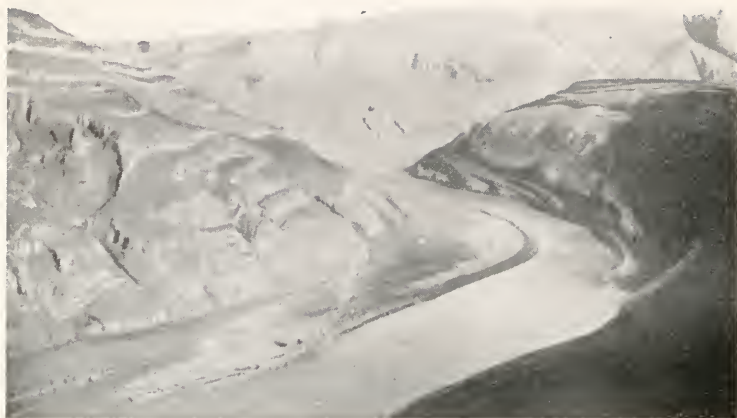
CANYON OF THE CHING RIVER, WESTERN SHENSI