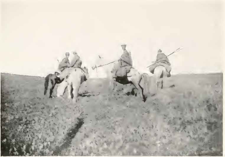
TIBETAN NOMADS ON THE KOKONOR BORDER