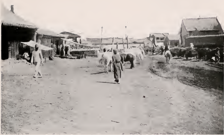
PONY FAIR ON THE CHINESE-MONGOLIAN BORDER