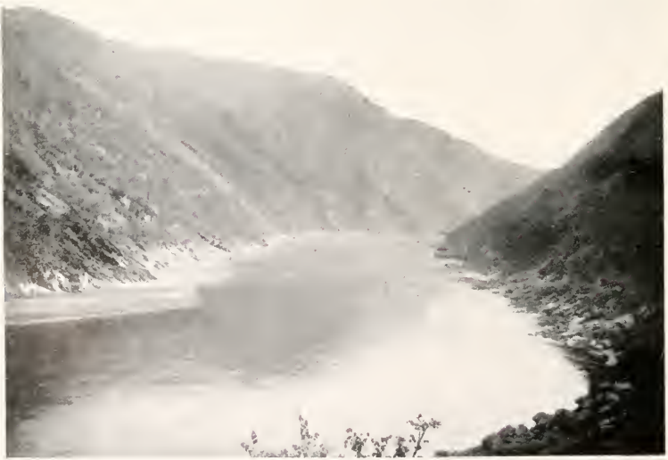
GORGES OF HAN RIVER ABOVE SHIHCH'UAN