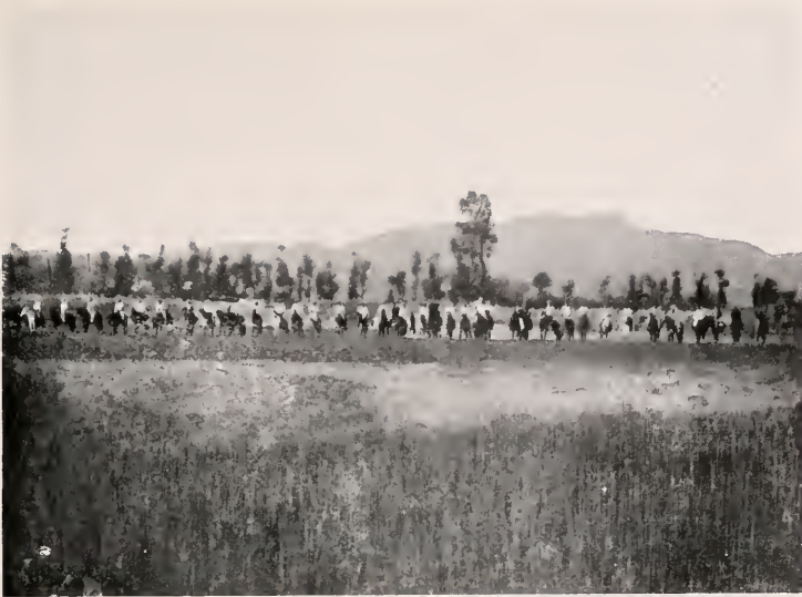
DEPARTURE FROM P'INGLIANG