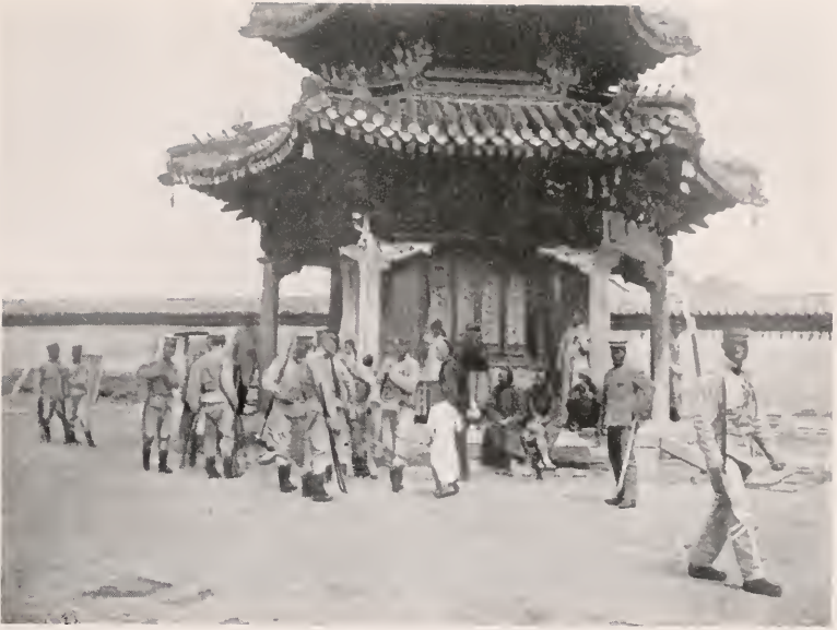
CHINESE TROOPS ON ACTIVE SERVICE IN INNER MONGOLIA