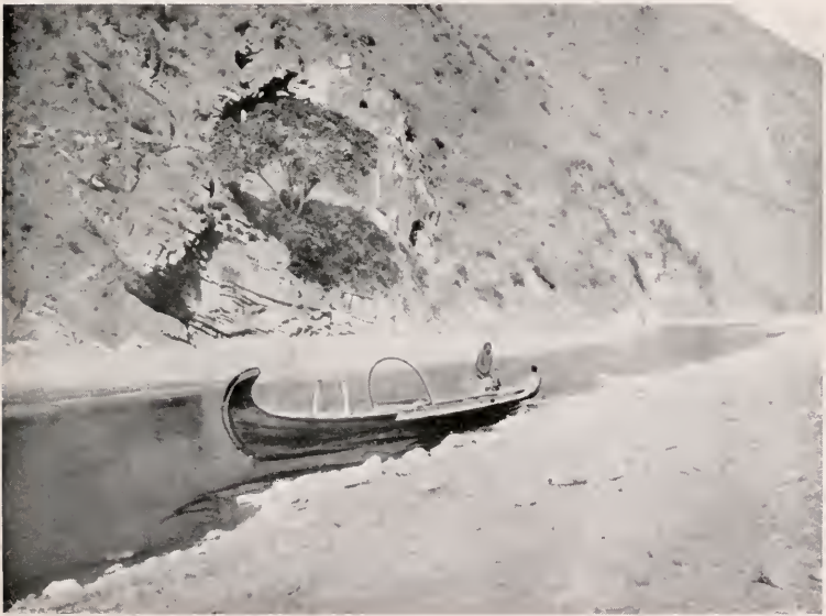
CANOE BOAT ON THE CH'IENYU RIVER