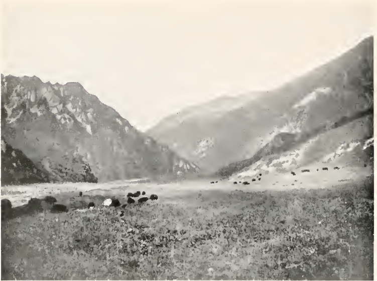
LOWER END OF PIEN TU K'OU GORGE, LEADING TO THE KOKONOR