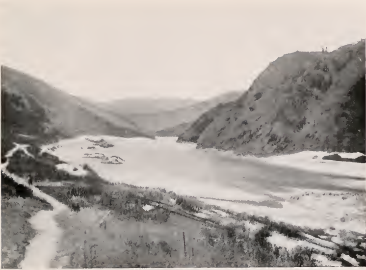
HAN RIVER AT CH'A CHEN