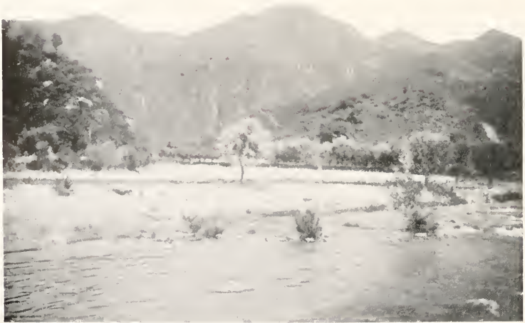
TUNG RIVER VALLEY NEAR FENGHSIEN IN S.W. SHENSI