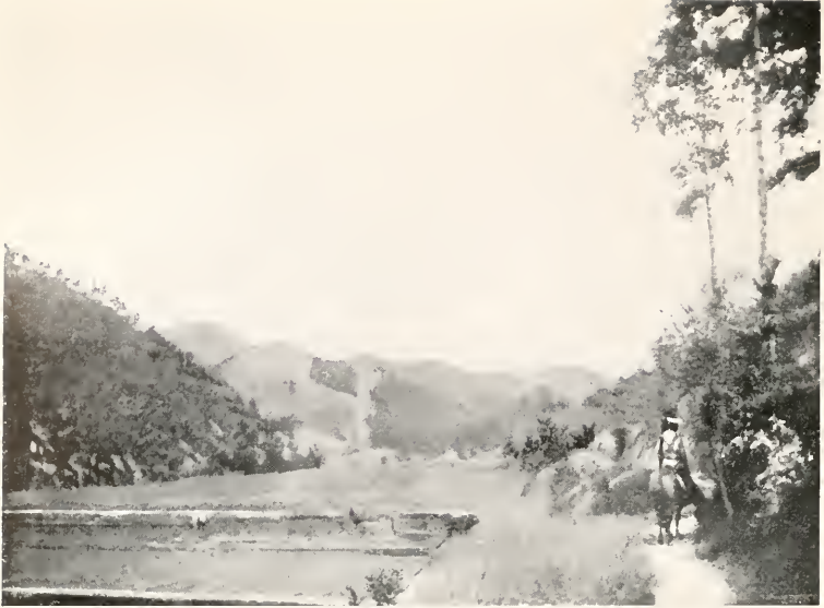
TRAIL THROUGH THE FOOTHILLS NEAR KULUPA