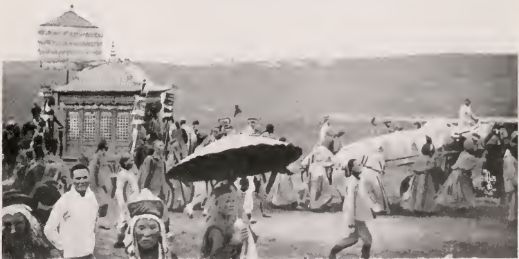
THE "CIRCUMAMBULATION BY THE COMING BUDDHA" AT A MONASTERY IN EASTERN INNER MONGOLIA