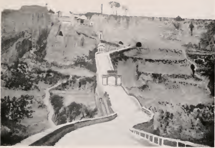
STONE CAUSEWAY ACROSS LOESS RIFT, E. SHENSI