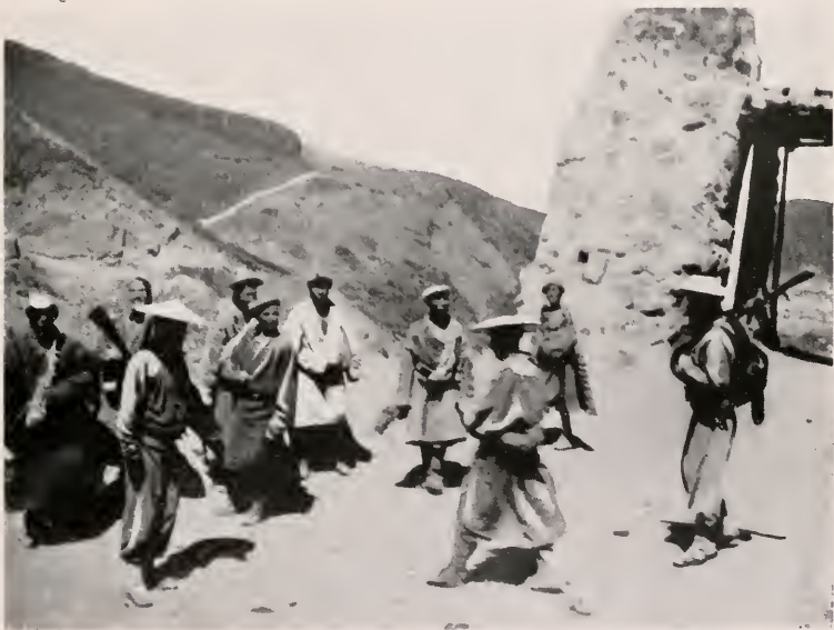
TIBETAN VILLAGERS AND MAHOMEDAN SOLDIERS