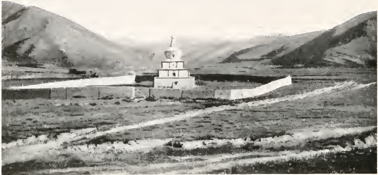
APPROACH TO TIBETAN COUNTRY WEST OF T'AOCHOU