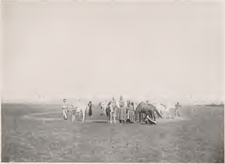
NATIVE PONY RACING IN INNER MONGOLIA : THE PADDOCK