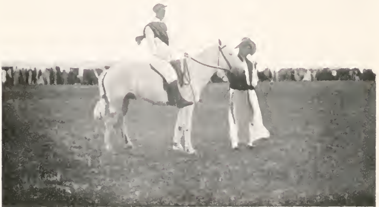
NATIVE PONY RACING IN INNER MONGOLIA : THE WINNER