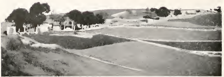
TREE-LINED HIGHWAY THROUGH CENTRAL KANSU