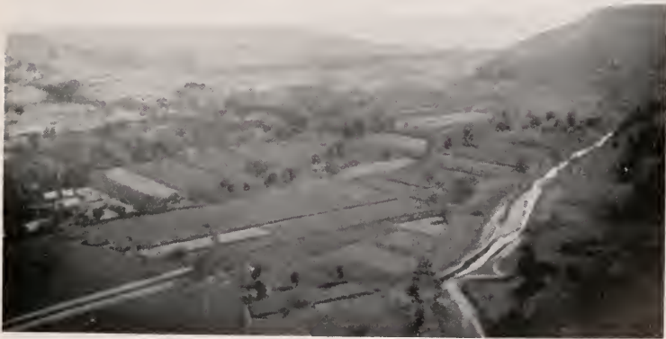
INDIGO FIELDS IN IRRIGATED LOESS VALLEY NEAR HANCHI'ENG