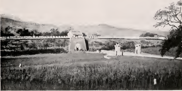
CITY OF LINYU FROM THE NORTH