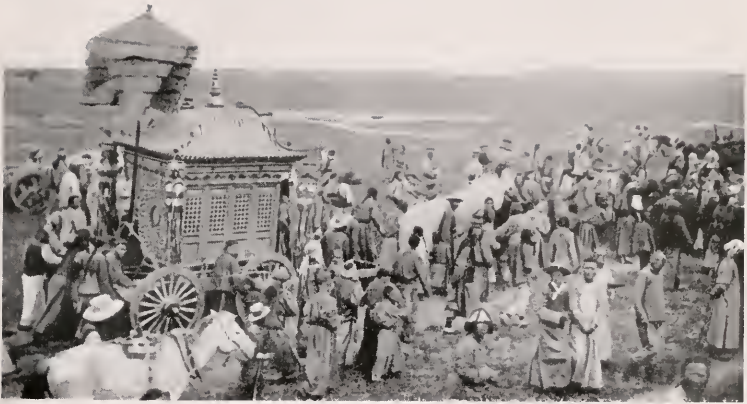
THE "CIRCUMAMBULATION BY THE COMING BUDDHA" AT A MONASTERY IN EASTERN INNER MONGOLIA