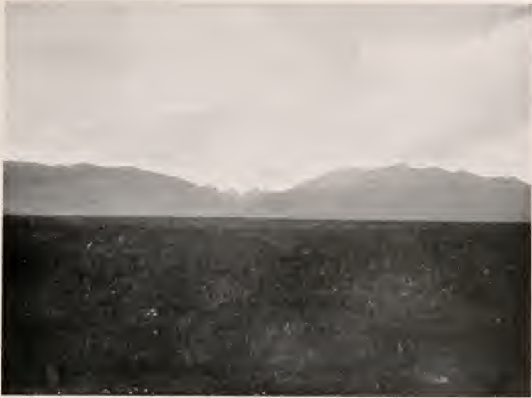
GRASS PRAIRIE (11,000 FEET) NEAR YUNGAN