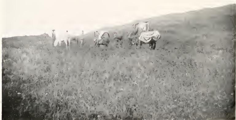
ON THE ROAD BETWEEN KUEIHUA CH'ENG AND FENG CHEN