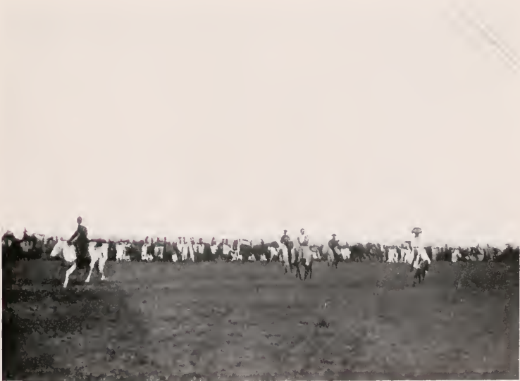
NATIVE PONY RACING IN INNER MONGOLIA : THE PARADE