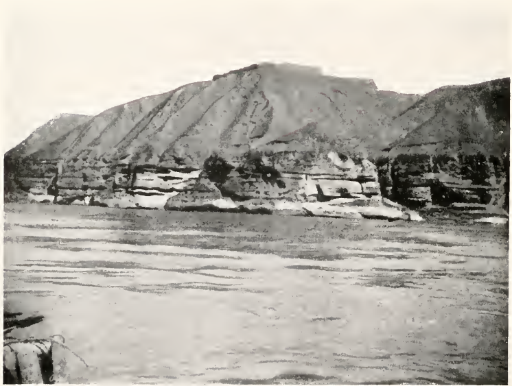
SANDSTONE CLIFFS OF UPPER YELLOW RIVER