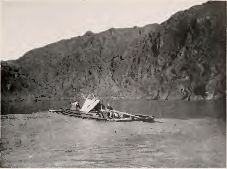
RAFTING DOWN THE GORGES OF THE UPPER YELLOW RIVER