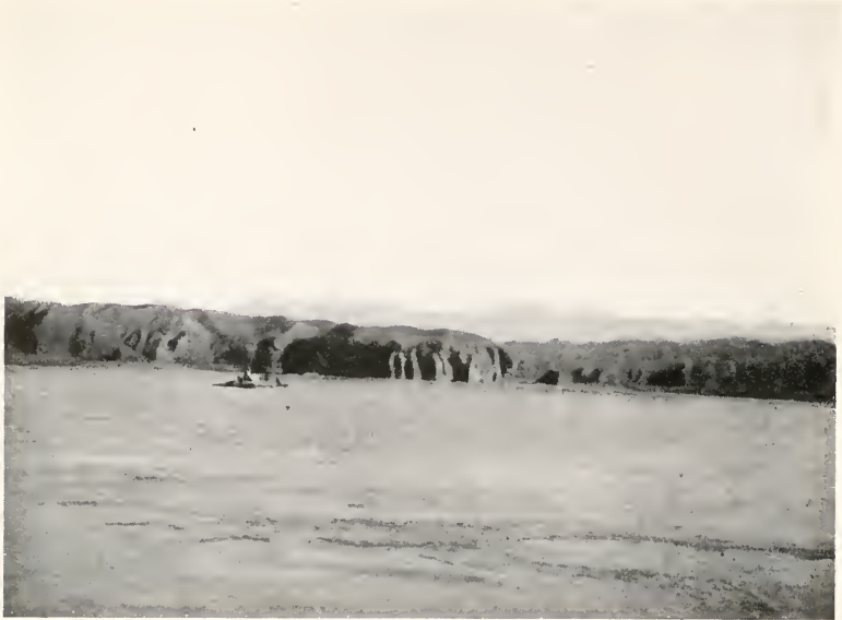
SANDSTONE CLIFFS OF UPPER YELLOW RIVER