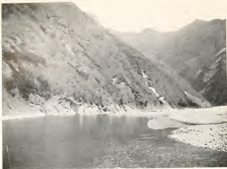
GORGES OF THE CH'IENYU RIVER BELOW CHENAN