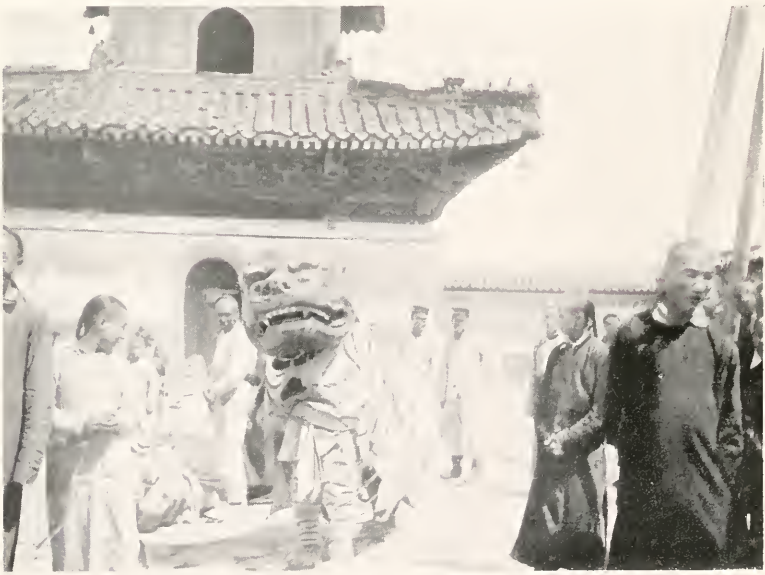
BEHIND THE SCENES AT A LAMA DEVIL DANCE, EASTERN INNER MONGOLIA