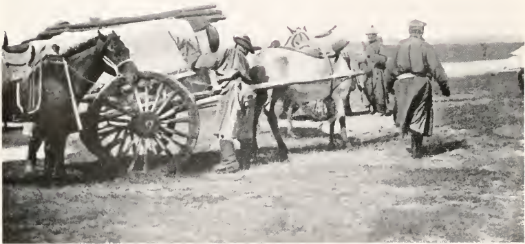
MONGOLS MOVING CAMP