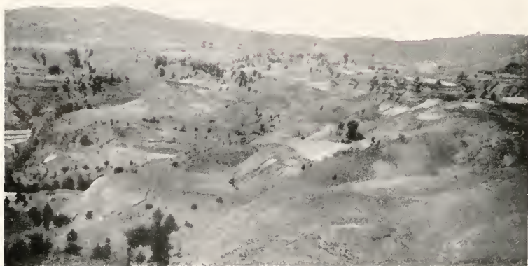
THE LOESS COUNTRY OF CENTRAL KANSU