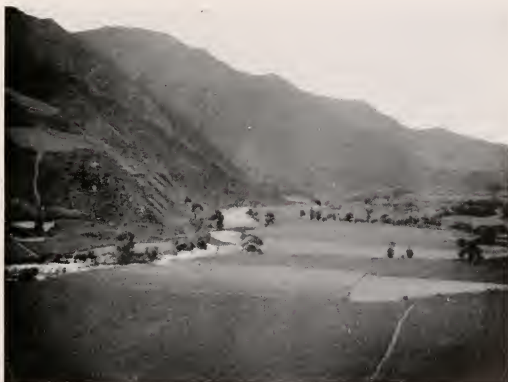
VALLEY IN S.W. SHENSI NEAR SZECHUAN BORDER