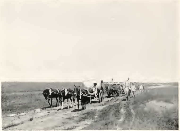
ON A MAIN ROAD IN THE GRASS COUNTRY OF THE CHINESE-MONGOLIAN BORDER