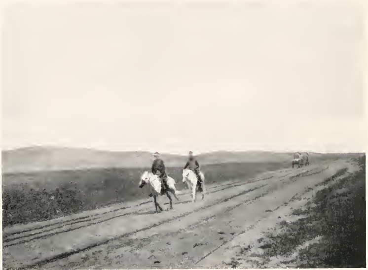
ON A MAIN ROAD IN THE GRASS COUNTRY OF THE CHINESE-MONGOLIAN BORDER