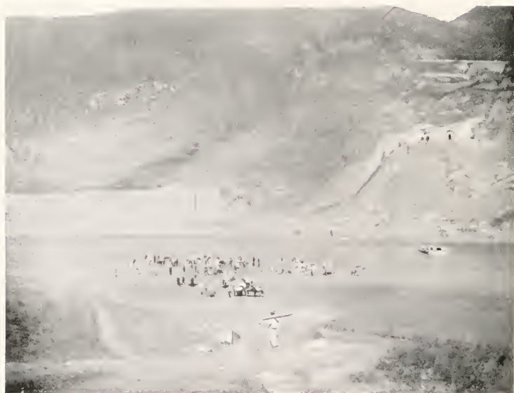
FERRY ACROSS THE CHING RIVER