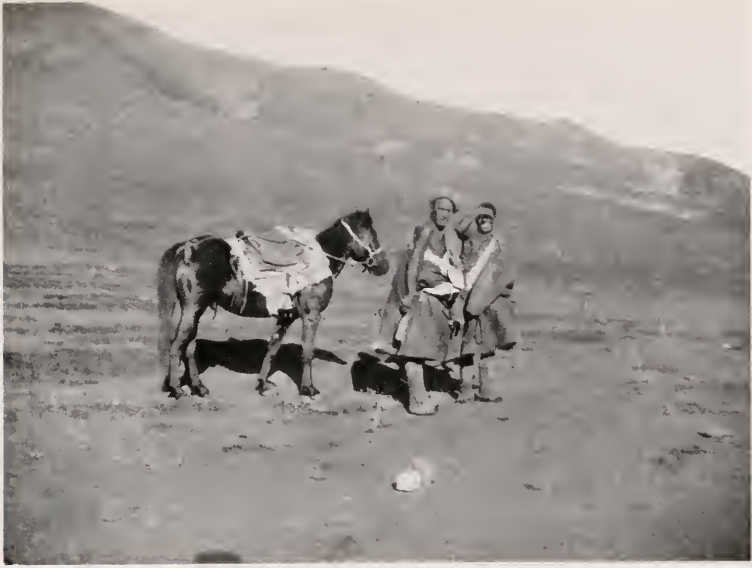
NOMAD TIBETANS ON THE GRASS-LANDS NEAR LABRANG