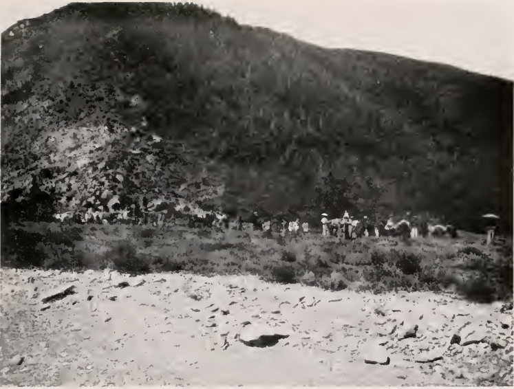
A MIDDAY HALT ON THE ROAD TO LABRANG