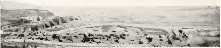
CITY OF CH'UNHUA FROM THE N.E.