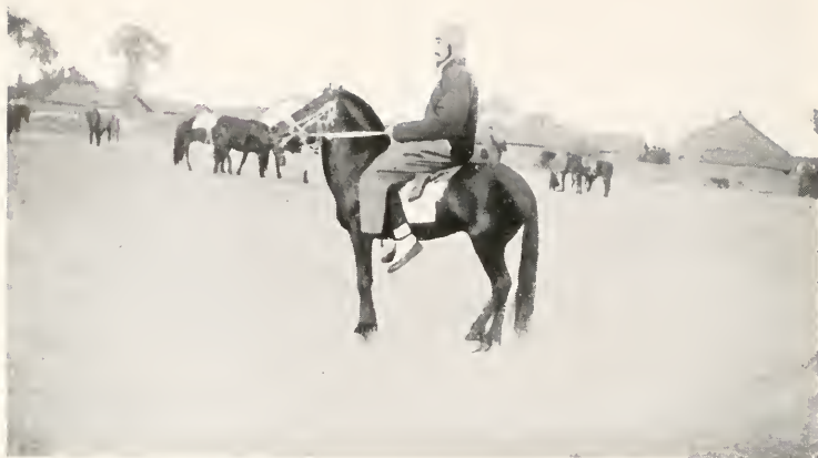
THE DIMINUTIVE SZECHUAN PONY