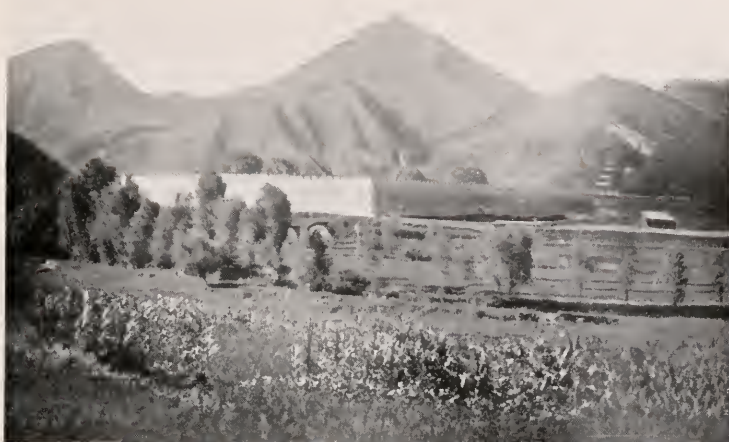
CITY OF LIUPA T'ING, S.W. SHENSI