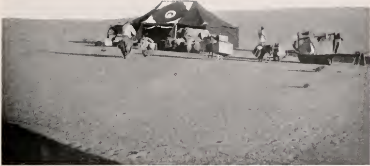
CAMP IN THE ALASHAN DESERT, NEAR CHENFAN