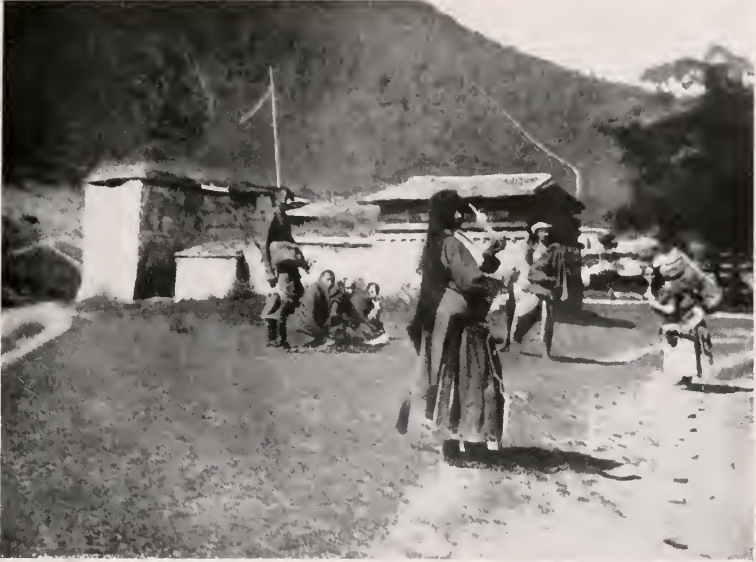
TIBETAN VILLAGERS NEAR KACHIA SSU