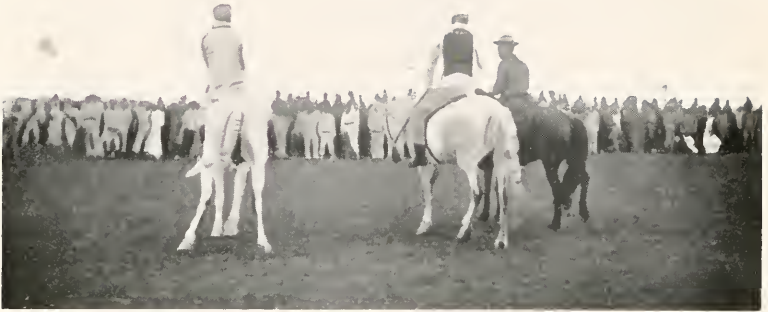
NATIVE PONY RACING IN INNER MONGOLIA : THE START