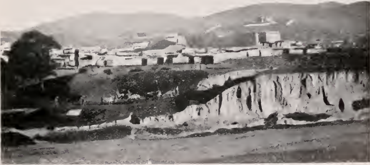
VIEW OF THE MONASTERY OF HEITSO SSU