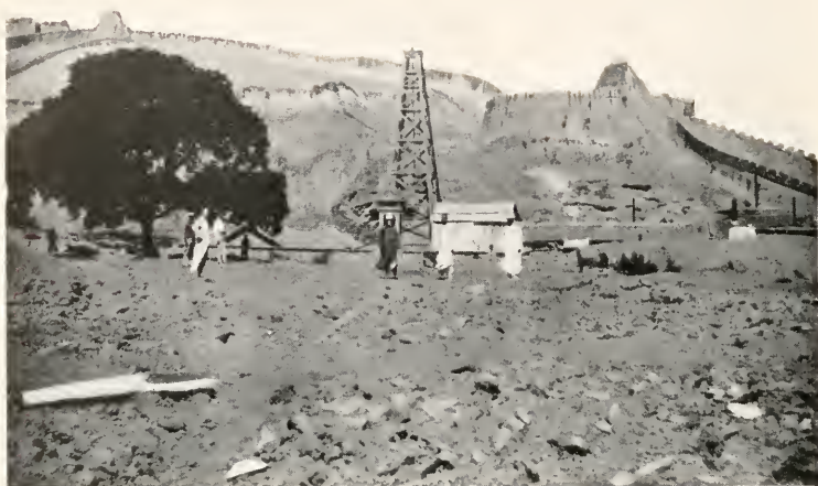
OIL WELL AT YENCH'ANG