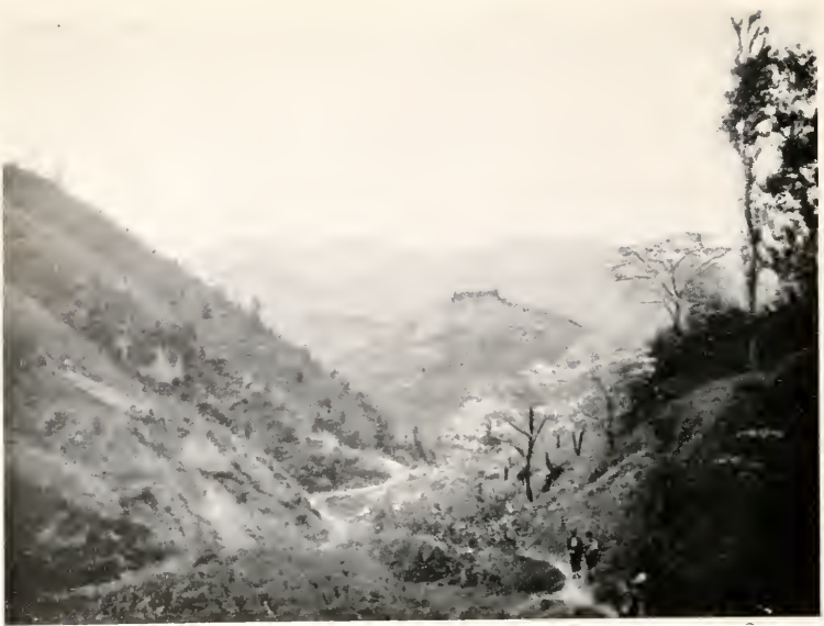
GLEN ON THE ROAD BETWEEN HANYIN AND SHIHCH'UAN