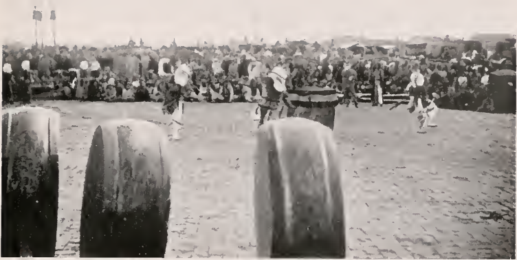
RELIGIOUS DANCE AT A LAMA MONASTERY, EASTERN INNER MONGOLIA