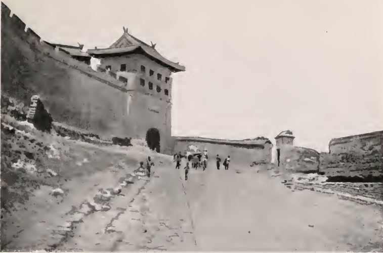
EAST GATE OF THE FORTRESS OF T'UNGKUAN