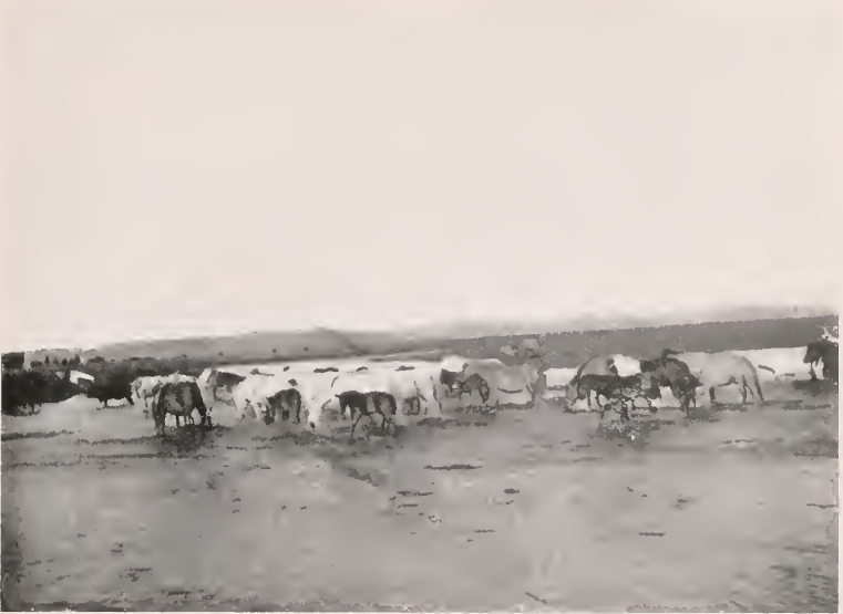
THE "CHINA PONY" ON HIS NATIVE STEPPES