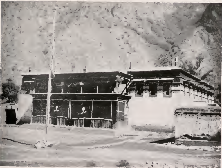
A PORTION OF THE MONASTERY OF KACHIA SSU