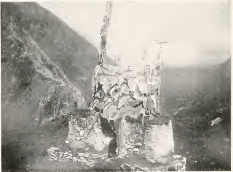
TIBETAN PRAYER FLAGS