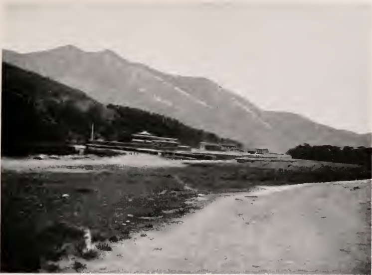
VIEW OF LABRANG MONASTERY