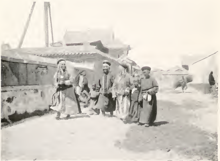
MONGOL WOMEN IN GALA DRESS