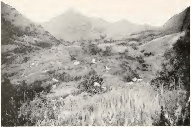
SUMMIT OF CH'INLING PASS ON MAIN ROAD TO SZECHUAN