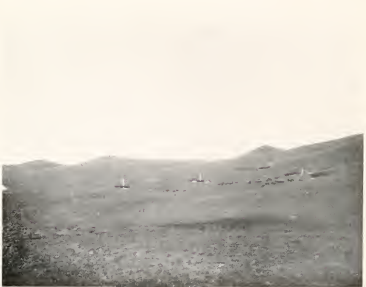
TIBETAN ENCAMPMENTS NEAR LABRANG