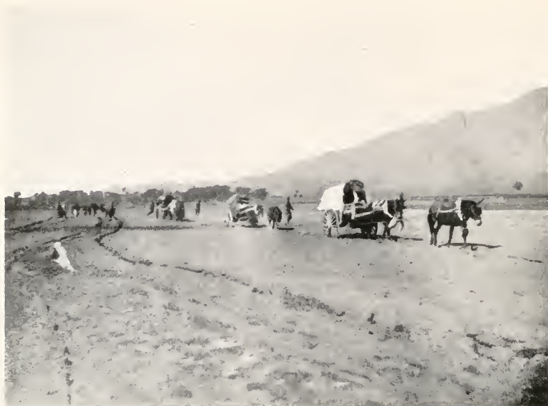
ON THE ROAD BETWEEN PAOT'OU AND KUEIHUA CH'ENG