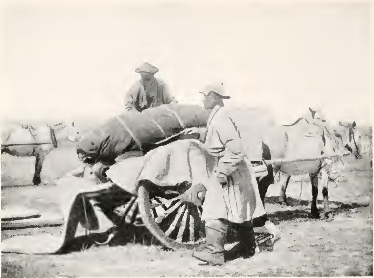
MONGOLS MOVING CAMP