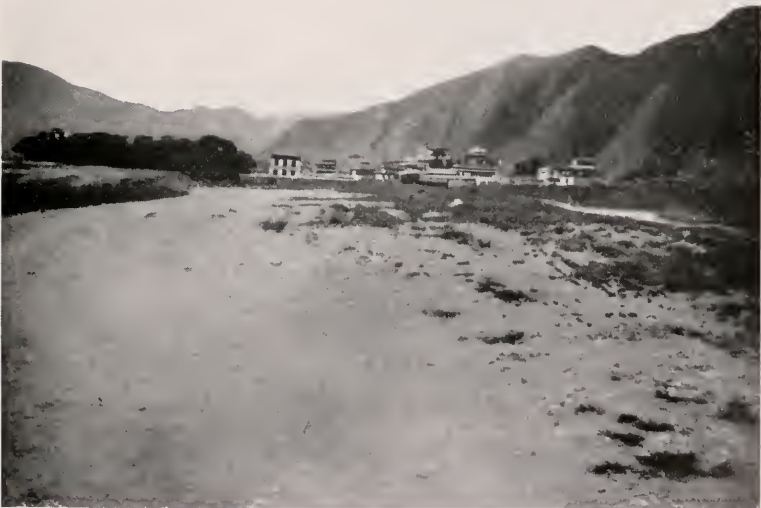
VIEW OF LABRANG MONASTERY (The two views join to form a panorama)