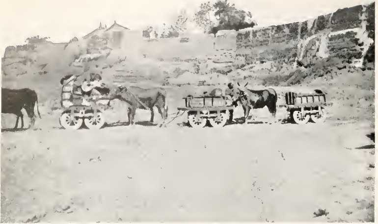
FOUR-WHEELED OX CARTS NEAR T'UNGKUAN