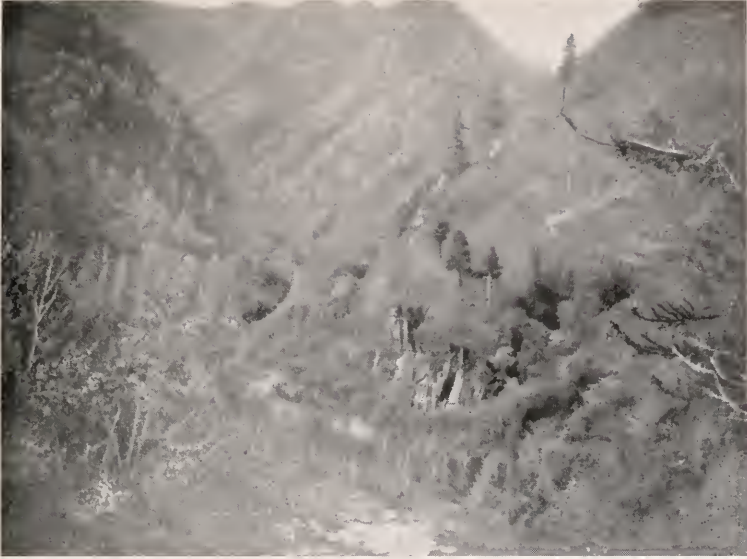
GORGE IN THE CH'INLING SHAN ON THE TRAIL TO FOP'ING