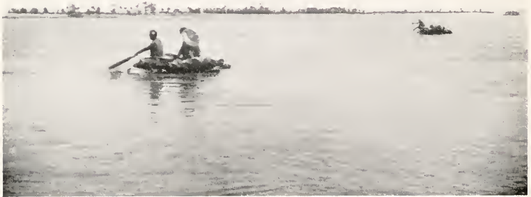
RAFTS OF INFLATED SKINS ON THE YELLOW RIVER