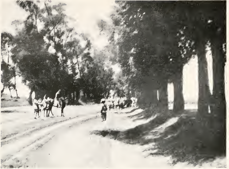
TREE-LINED HIGHWAY THROUGH CENTRAL KANSU