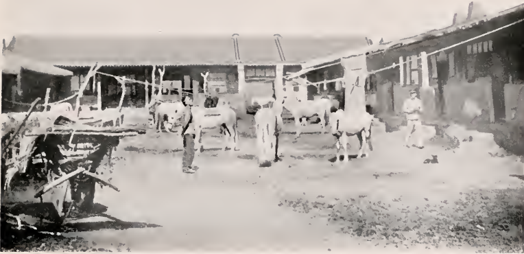
NORTH CHINA CART INN