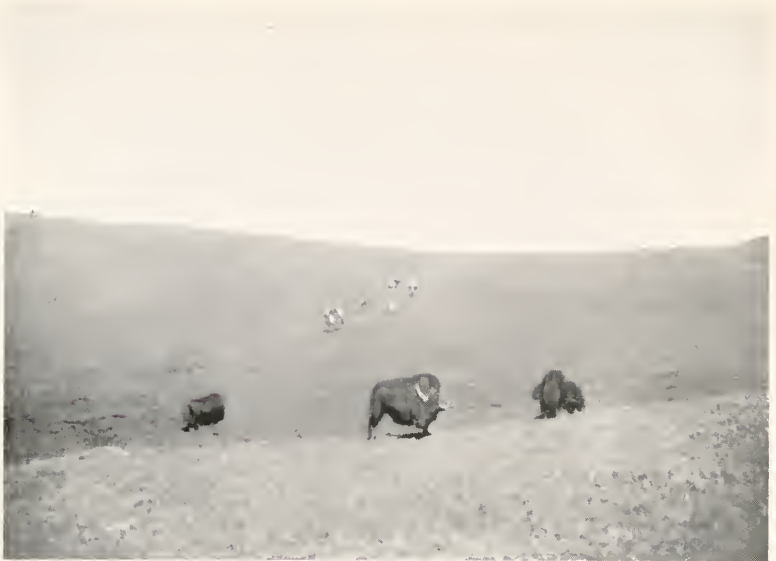
GRASS COUNTRY (11,000 FEET) ON THE ROAD TO LABRANG