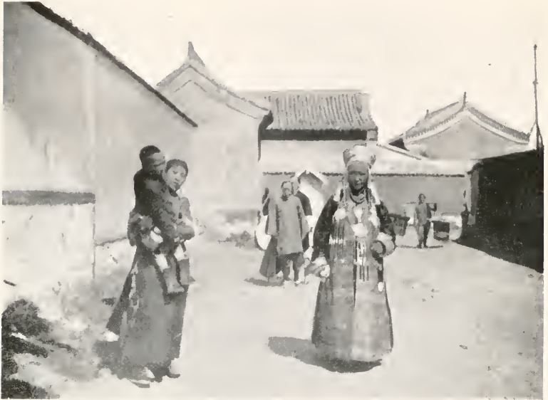
MONGOL WOMEN IN GALA DRESS