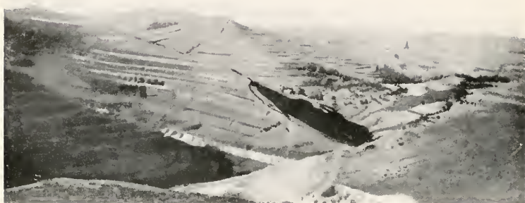
THE LOESS COUNTRY OF CENTRAL KANSU