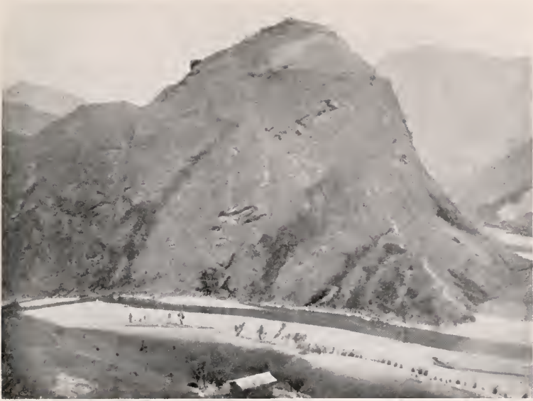
CHAITZU (HILL FORT) ON THE CH'IENYU RIVER