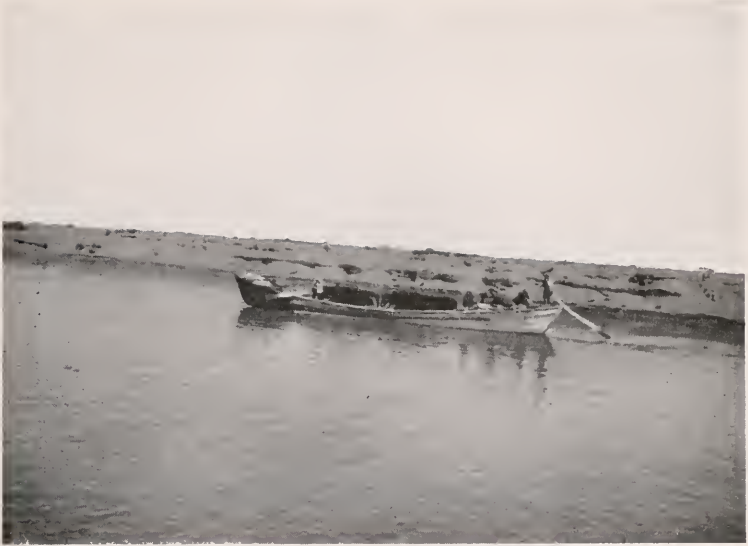
PONIES EMBARKED FOR THE JOURNEY ROUND THE ORDOS