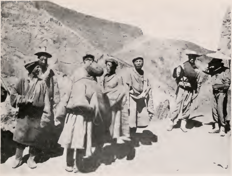
TIBETAN VILLAGERS AND MAHOMEDAN SOLDIERS