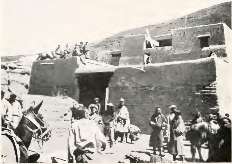
HALT IN A TIBETAN VILLAGE WEST OF T'AOCHOU