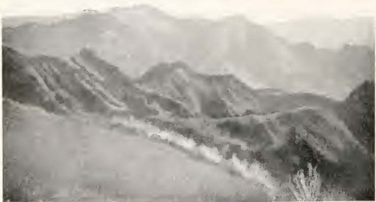
VIEW FROM THE HSINGLUNG LING ON THE FOP'ING TRAIL