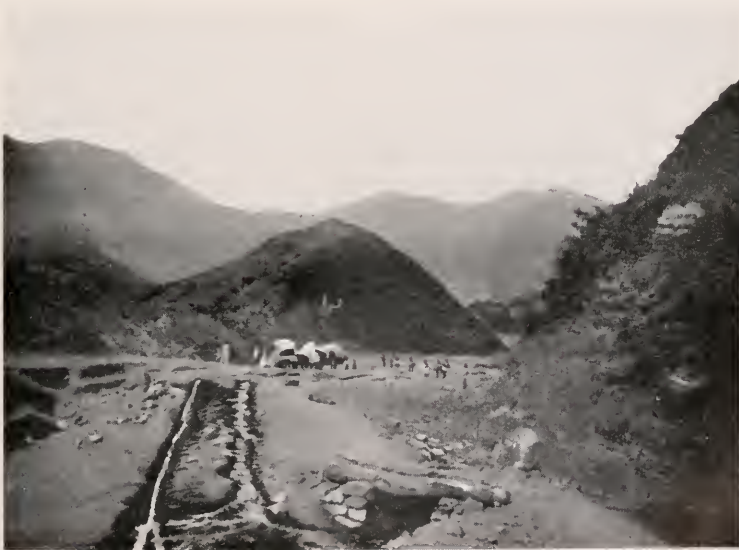
APPROACH TO THE LIUPAN SHAN PASS