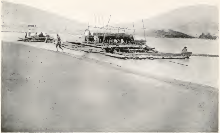
OUR PONIES RAFTING DOWN THE UPPER YELLOW RIVER