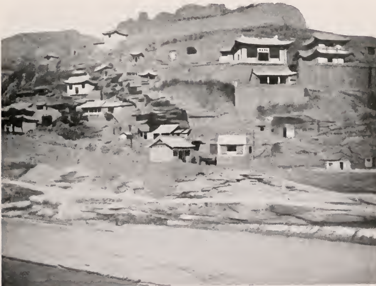
CAVE TEMPLES IN SANDSTONE CLIFF OPPOSITE YENAN