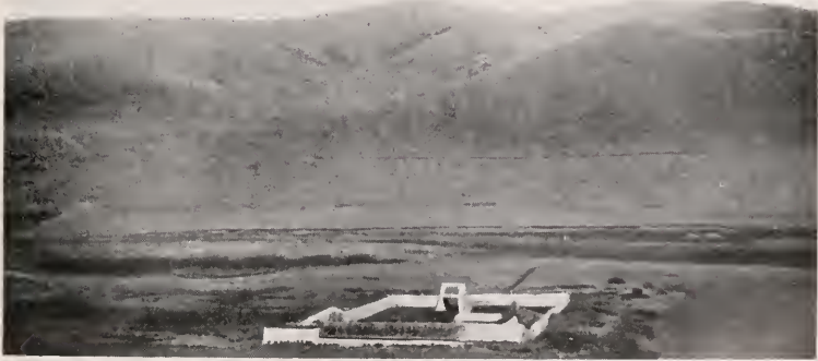
CHINESE SETTLER'S CATTLE-FARM ON THE GRASS-LANDS