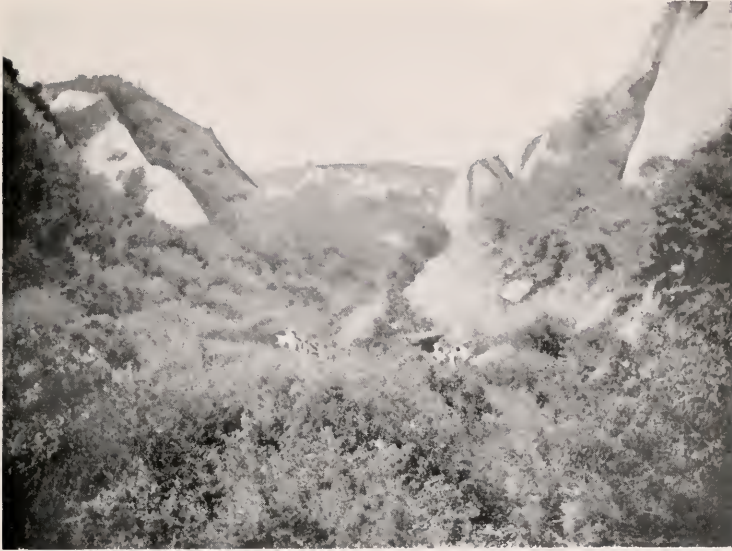
DIVIDE BETWEEN THE LO HO AND YEN SHUI NEAR YENAN