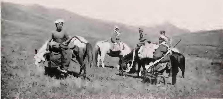
NOMAD TIBETANS ON THE GRASS-LANDS NEAR LABRANG