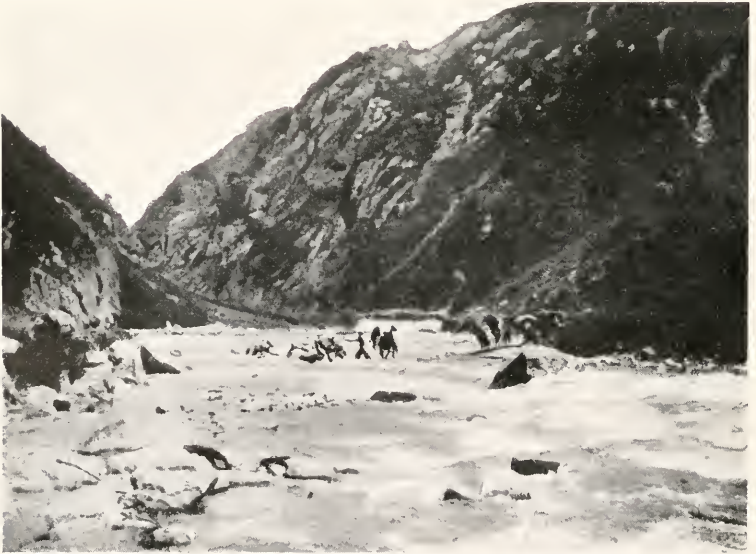
TRAVELLING UP THE PIEN TU K'OU GORGE