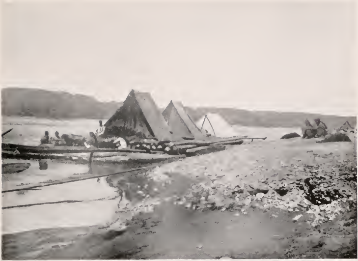
OUR RAFTS ON THE UPPER YELLOW RIVER