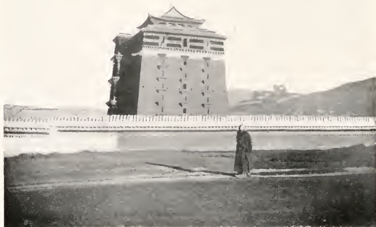
PORTION OF HEITSO MONASTERY