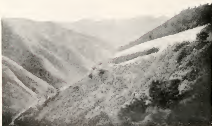
IN THE MOUNTAINS OF E. SHENSI