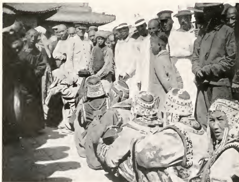
SCENE AT A LAMA FESTIVAL, EASTERN INNER MONGOLIA