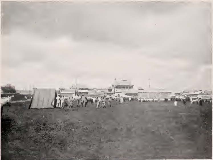
CHINESE TROOPS ON ACTIVE SERVICE IN INNER MONGOLIA