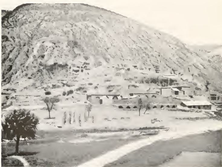
CAVE VILLAGE IN SEMI-DESERT COUNTRY NEAR YANAN