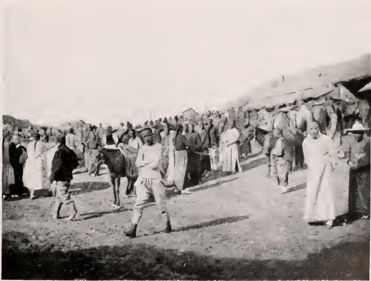
PONY FAIR ON THE CHINESE-MONGOLIAN BORDER