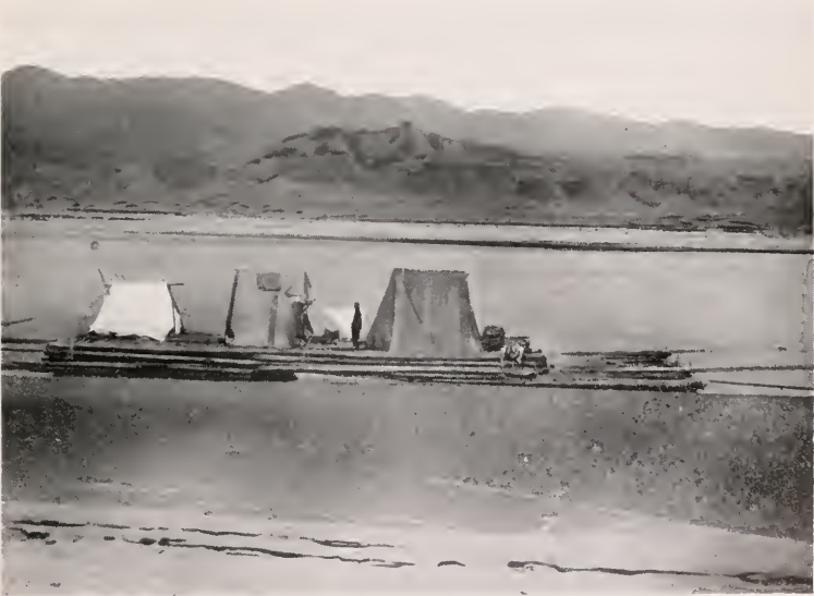
OUR RAFTS ON THE UPPER YELLOW RIVER