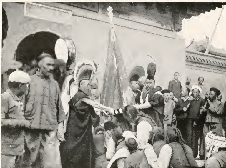
SCENE AT A LAMA FESTIVAL, EASTERN INNER MONGOLIA