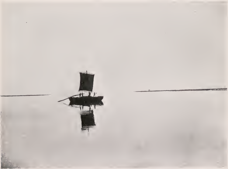
ON THE YELLOW RIVER NEAR PAOT'OU