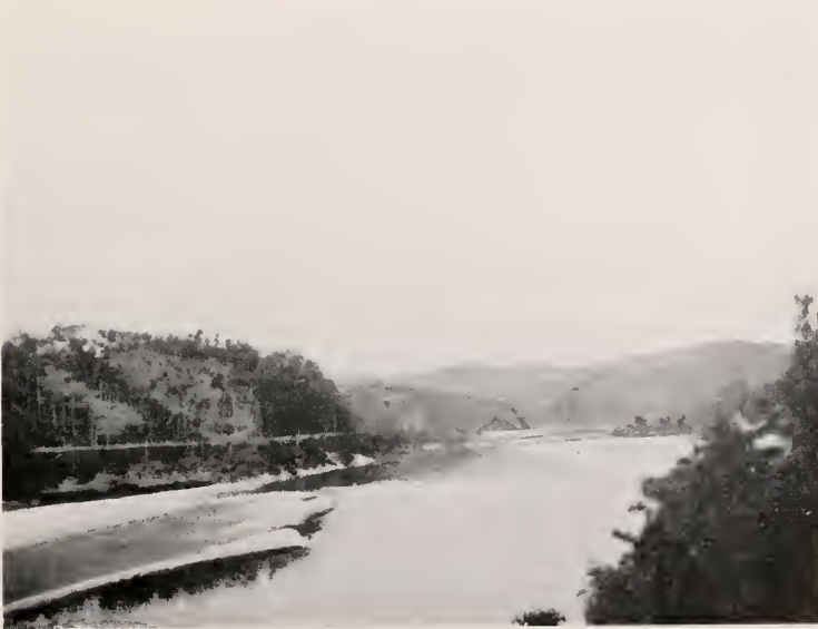
MUMA RIVER ABOVE HSIHSIANG