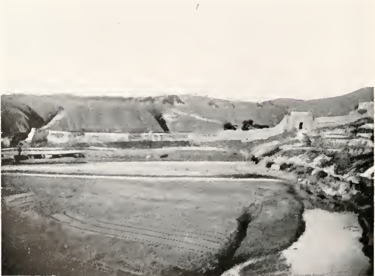
CITY OF CHUNGPU FROM THE E.