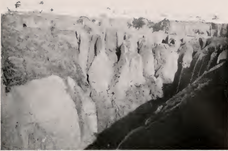
VIEW ACROSS RIFTS IN THE LOESS PLATEAU NEAR FUCHOU