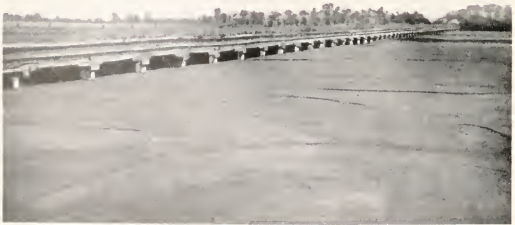
STONE BRIDGE ON THE ROAD TO HSIAN FU