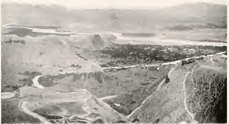
T'AO RIVER VALLEY BETWEEN HOCHOU AND LANCHOU FU