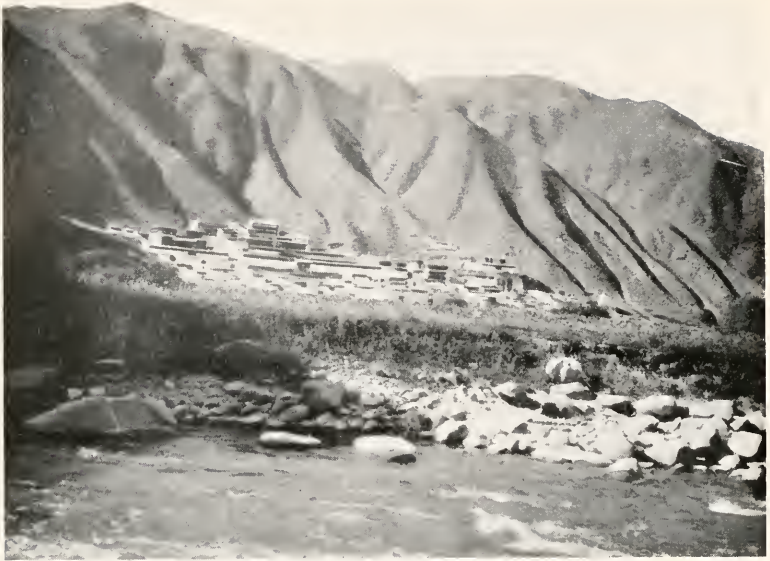
MONASTERY OF SHAKOU SSU