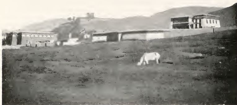
PORTION OF HEITSO MONASTERY