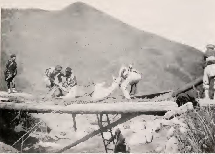
ACCIDENT TO A PONY ON THE FOP'ING TRAIL