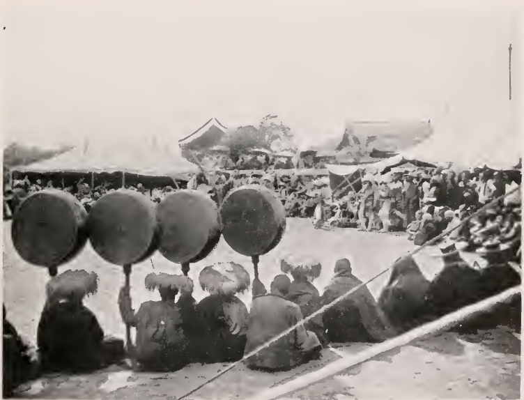
RELIGIOUS DANCE AT A LAMA MONASTERY, EASTERN INNER MONGOLIA