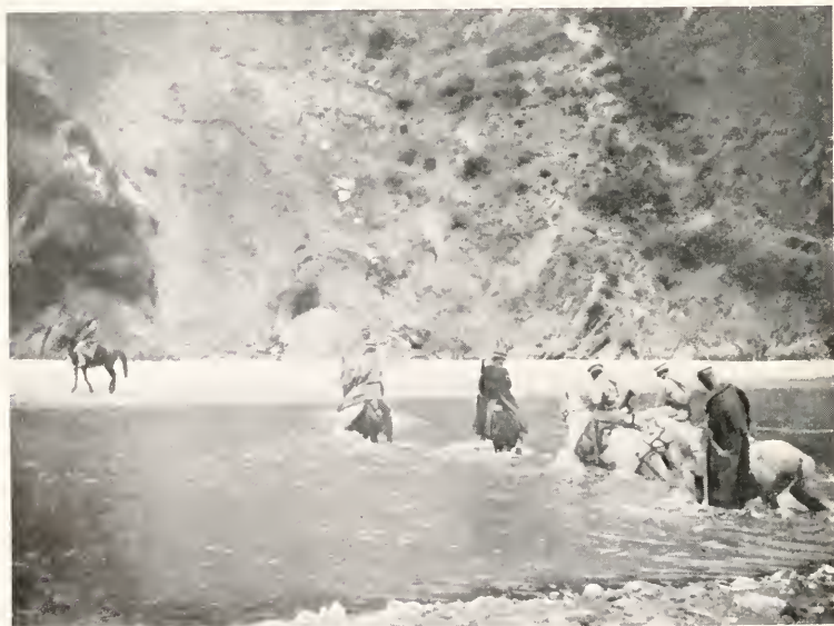
FORDING THE CH'IENYU RIVER BELOW CHENAN