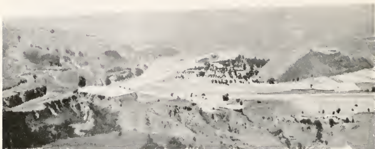
LO RIVER IN A VALLEY IN THE LOESS PLATEAU NEAR FUCHOU