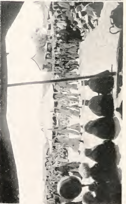
THE "DANCE OF THE BLACK HAT"