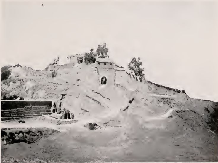
CHAITZU (HILL FORTRESS) OF TSUIMU, WESTERN SHENSI