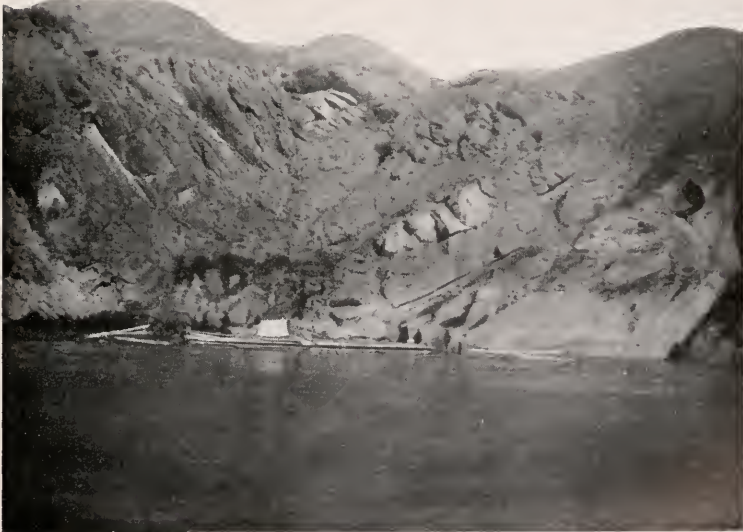
RAFTING DOWN THE GORGES OF THE UPPER YELLOW RIVER