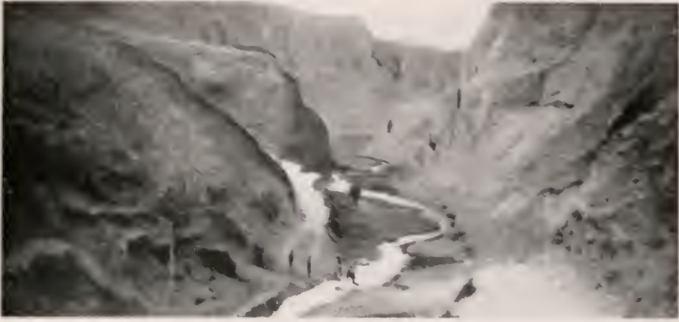
AT THE BOTTOM OF A LOESS RIFT, WESTERN SHENSI