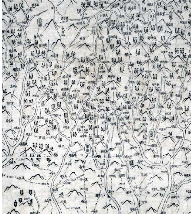
The Central Qinling in Yan Ruyi's "Map of Four Provinces North of the Han River"

This document has been written to provide background information and web references for a set of Google Earth presentations. The subject involves some maps produced between 1813 and 1822 of areas basically in and near the catchment of the upper Han River. They were produced under the overall guidance of a Qing Period scholar official called Yan Ruyi who was Prefect of Hanzhong over much of this period. The Google Earth presentations are collected together into a zip file. Using a zip file forces them to be downloaded onto your computer for display and acts as a protected folder as well. When you unpack the file it will have 6 items on it. One is a PDF of this document and the other 5 are KMZ files providing access to maps and materials that appear scaled to fit at roughly the areas of China they concern. The KMZ files are quite small as the data are accessed via Network Link.